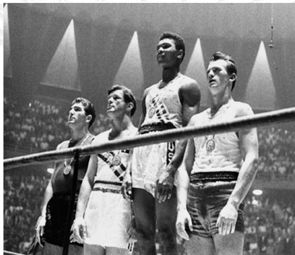
Cassius Clay's first major title; the Olympic Gold Medal in 1960.

Indeed, he should've retired around 1975 at the top of his game. Instead, the unnecessary punishment he took between 1976-1981 certainly played its part in his subsequent deteriorating medical condition. However, he remained an icon to millions, and is still, to this day - the greatest.